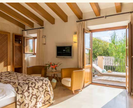
Terrace Deluxe Double

The ancient water tower (approx. 2 x 30m 2 ) features a circular downstairs living room with a staircase leading to the upstairs bedroom and bathroom overlooking the private terrace and gardens.