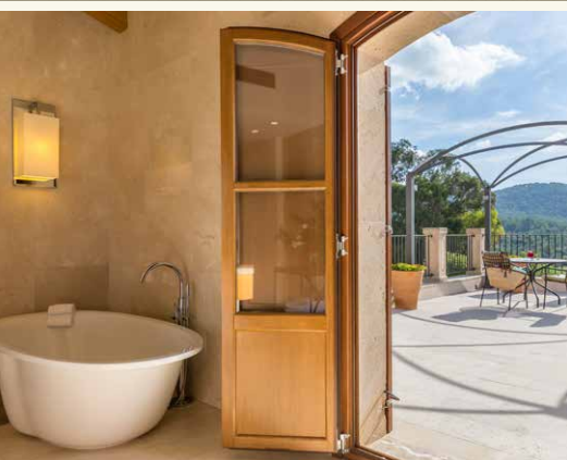
Demi Terrace Suite

The unique Demi Terrace Suite (approx. 50m 2 ) next to the main building features a generous bathroom complete with free-standing bathtub and large 90m 2 palatial terrace.