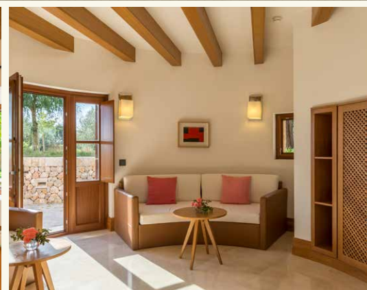
Water Tower Duplex

Located in the main house and in the estate gardens, the 4 Demi Suites (approx. 50m 2 ) with sofa bed in the dining/living area have individual features like a sun deck or herb garden.